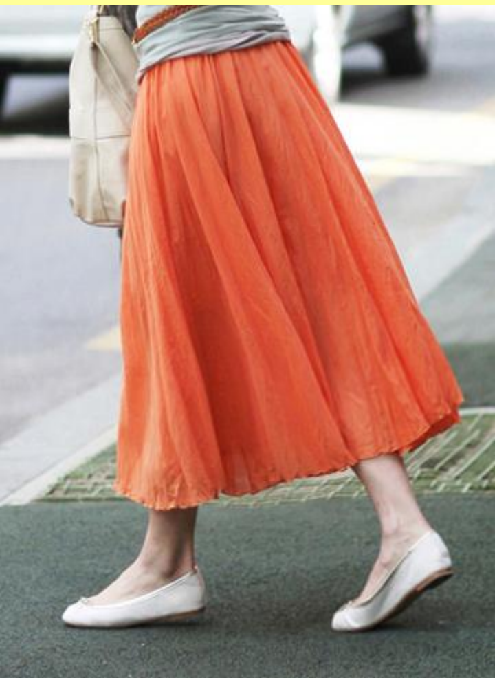
长裙 cháng qún